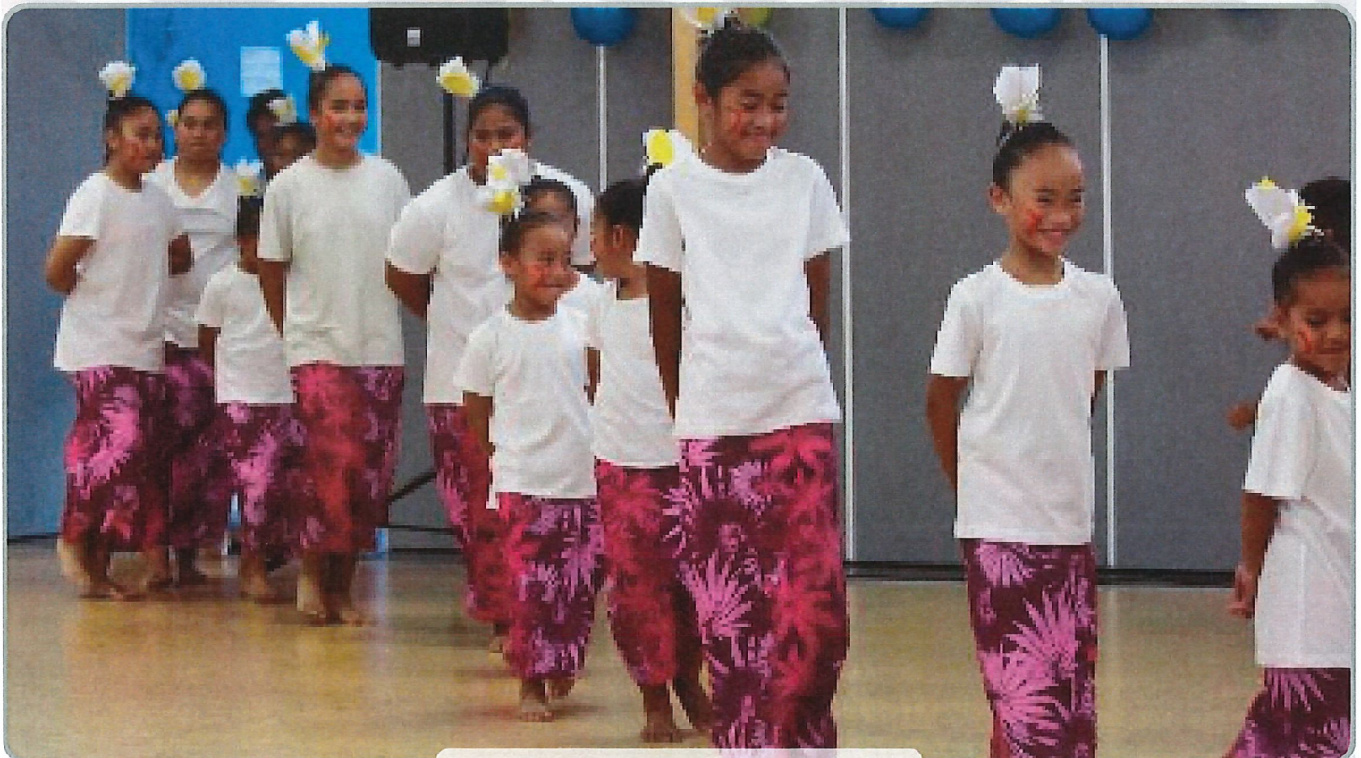
“O LE ALA I LE PULE, O LE TAUTUA”