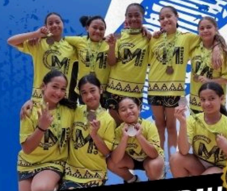
Y5/6 GIRLS NETBALL