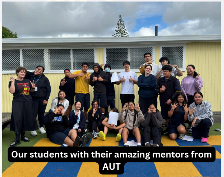
Our students with their amazing mentors from AUT

One of the highlights was visiting Auckland University for a special day. Our mentors showed us around the campus and took us to some incredible spaces, like a professional studio used for animation and film, a real chemistry lab, and a creative workshop filled with cool machines used to build robots and motors.