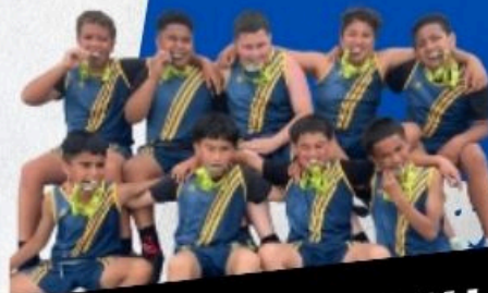
Y5/6 BOYS NETBALL