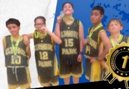
Y7/8 BOYS 3V3 BBALL