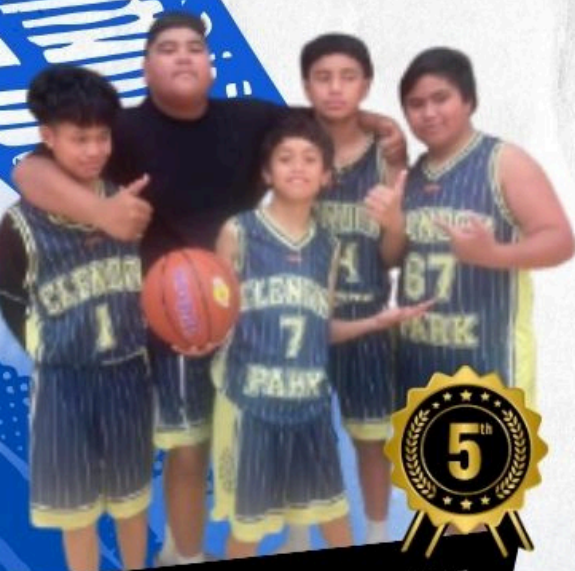
Y7/8 BOYS 3V3 BBALL