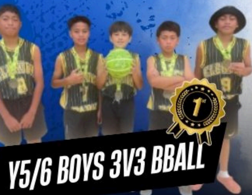
Y5/6 BOYS 3V3 BBALL