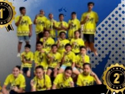
Y5/6 & Y7/8 VOLLEYBALL