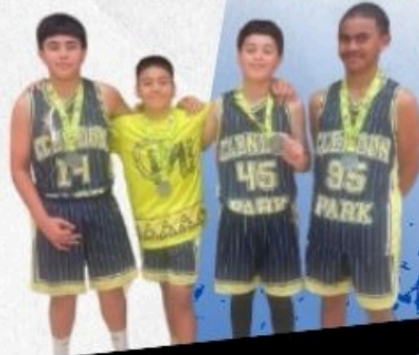
Y7/8 BOYS 3V3 BBALL