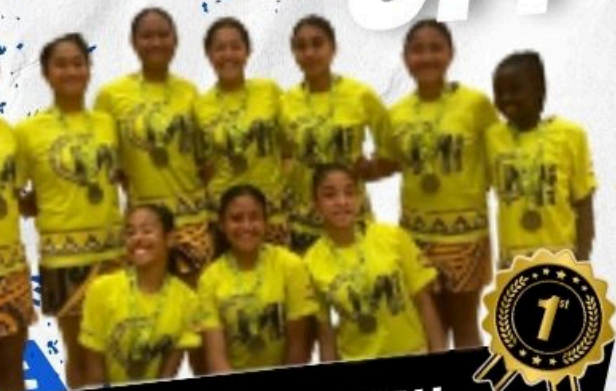
Y7/8 GIRLS NETBALL