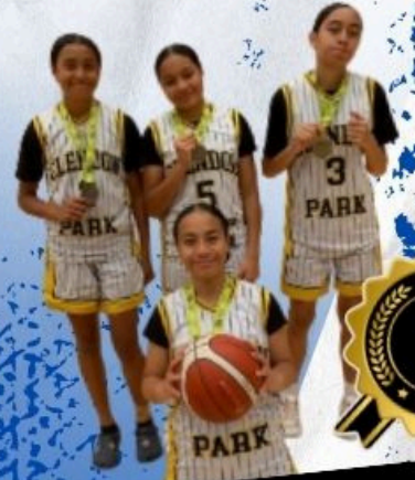
Y7/8 GIRLS 3V3 BBALL